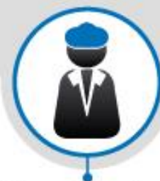
Shared services coordinator