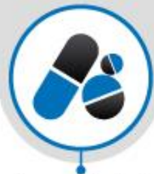
Local clinical commissioning group